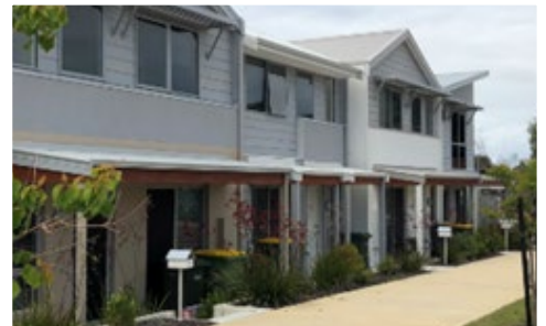
Google maps –Street view