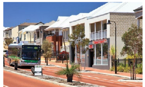
Western Australian Planning Commission Liveable Neighbourhoods Draft 2015