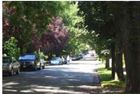
Google maps –Street view