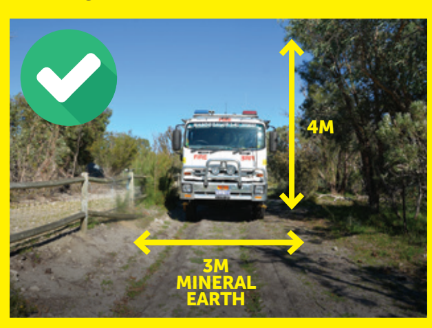
Land with a total area of 3,501m<sup>2</sup> or greater

The images below show examples of the difference between compliant and non-compliant properties of the three categories outlined in the attached fire notice.