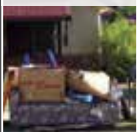
General bulk waste