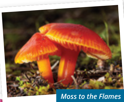
Moss to the Flames