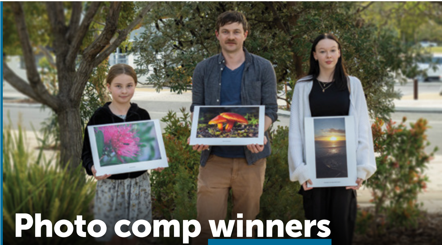
Photo comp winners

A 'Vibrant Kwinana' was captured and celebrated in this year's annual photography competition held by the City of Kwinana.