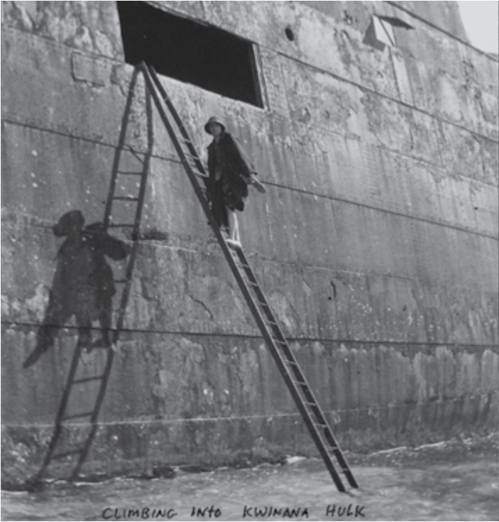
This image of the SS Kwinana taken around 1922 is believed to depict Clara Wells

This will include a boat building workshop; new signage being unveiled at Kwinana Beach; and an exhibition at the Darius Wells Library and Resource Centre.